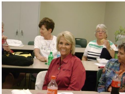
Happy faces ready to begin the day